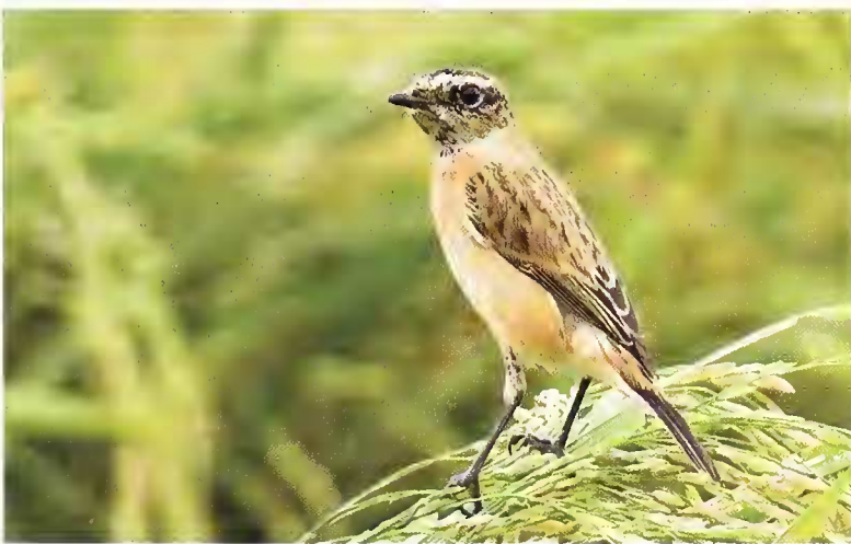
Plate 15. A first-winter male Stejneger's Stonechat Saxicola stejnegeri , University of the Philippines campus, Diliman, Quezon City, Luzon, 19 November 2007.